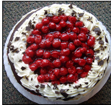
Black Forest Cake

6in. Serves 12.....$26.00 7in. Serves 16.....$27.00 8in. Serves 20.....$30.00 10in. Serves 32.....$33.00 12in. Serves 44.....$42.00 14in. Serves 60.....$55.00