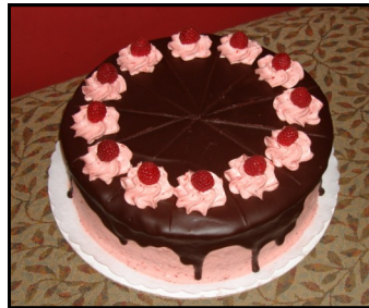
Raspberry Butter Cream